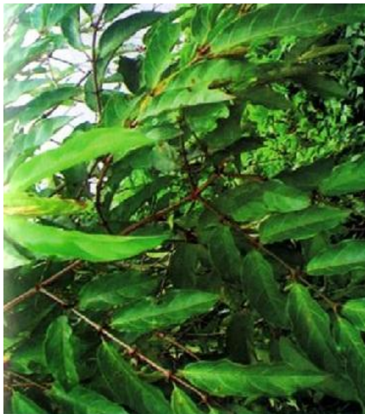
Figure 1. Salacia senegalensis